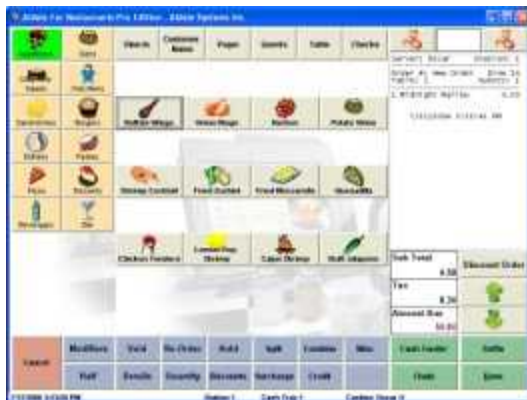
Table Service POS Screen

Aldelo For Restaurants enables you to access key features with the touch of a button. Best of breed technologies and functionalities are incorporated into Aldelo For Restaurants to help you simplify and maximize.